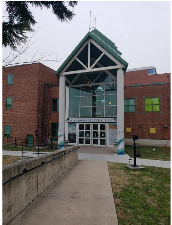
Rear Entrance to the Greensboro Cultural Center, from the Church Street Parking Deck