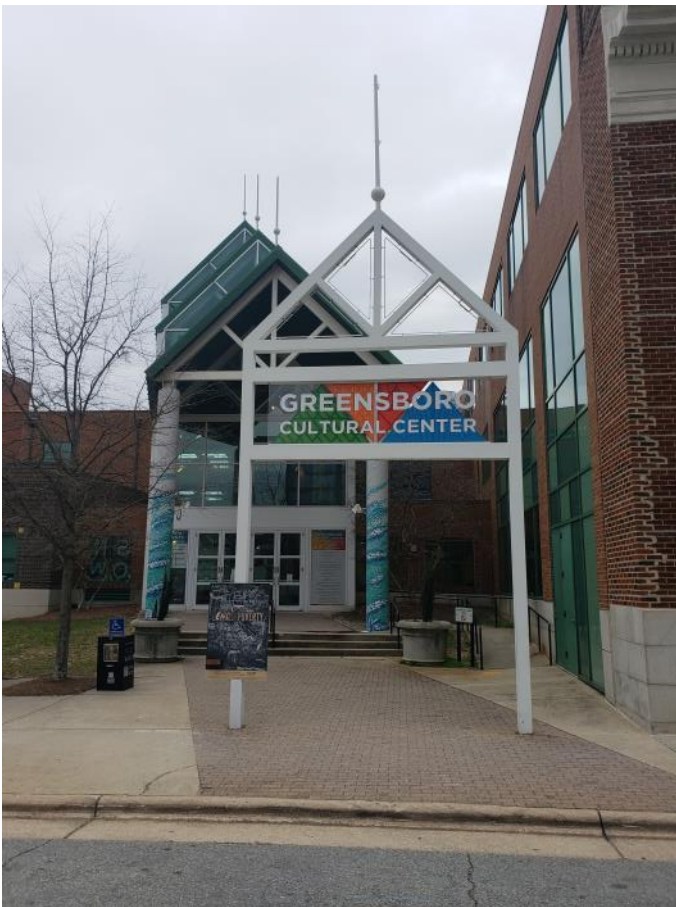
Front Entrance to the Greensboro Cultural Center, from Davie Street

Inside the Greensboro Cultural Center is where you will find GreenHill, as well as other art galleries, theaters, dance studios, and even Europa Cafe. You can enter the Greensboro Cultural Center through the main entrance off of North Davie Street or the rear entrance from the Church Street parking deck.