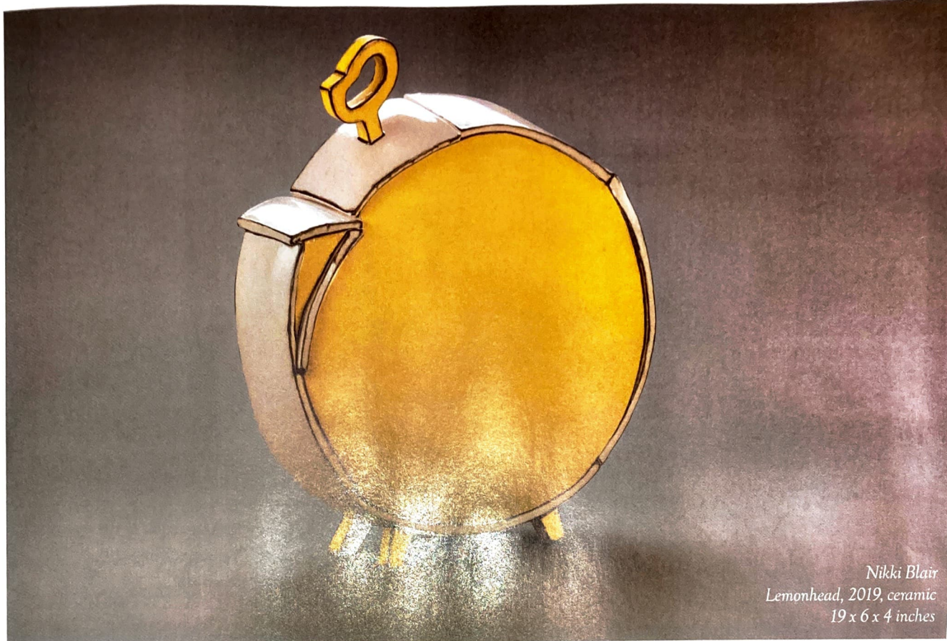
Nikki Blair Lemonhead , 2019, ceramic 19 x 6 x 4 inches