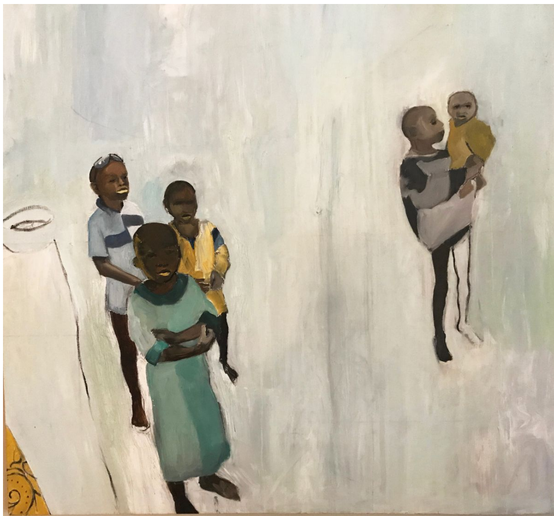
Dimeji Onafuwa, Omolomo (Someone Else's Children) , 2020, oil on canvas, 48 x 48 x 0.5 inches