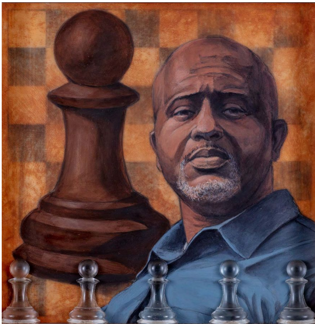
Steven M. Cozart, Pawn in the Game I , 2019, acrylic and resin casting on wooden chessboard, 2 x 12 inches