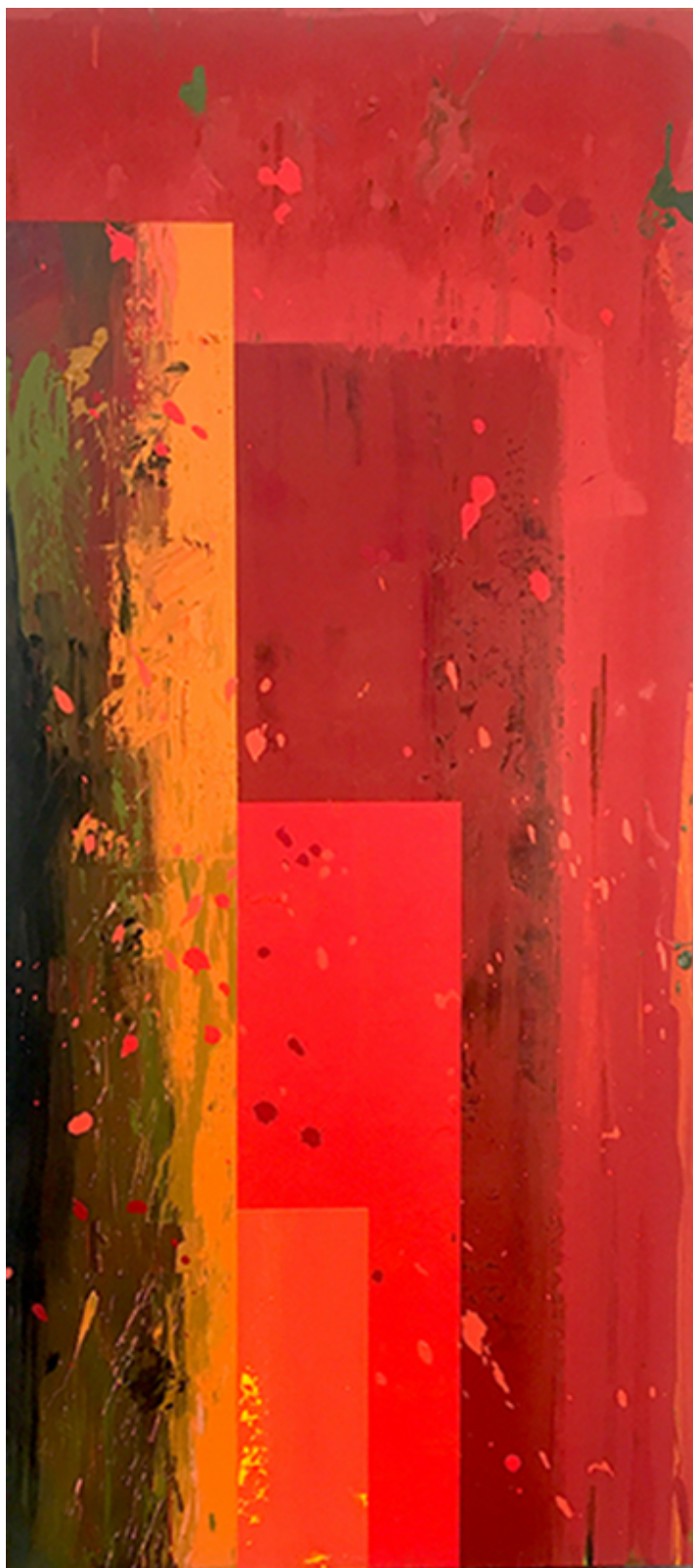
Frank Campion, Taraz , 2019, oil on linen, 84 x 38 inches