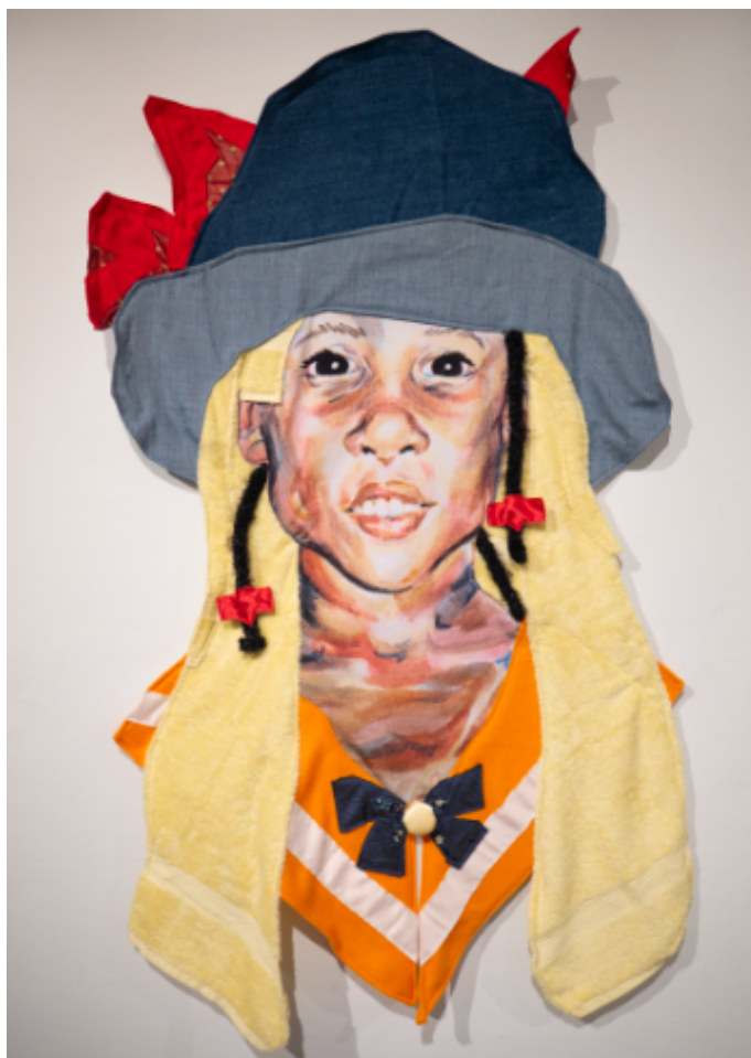
Jasmine Best, Sailor Venus , 2021, ink painting digitally printed on twill, collaged on found fabric, 55 x 33 inches