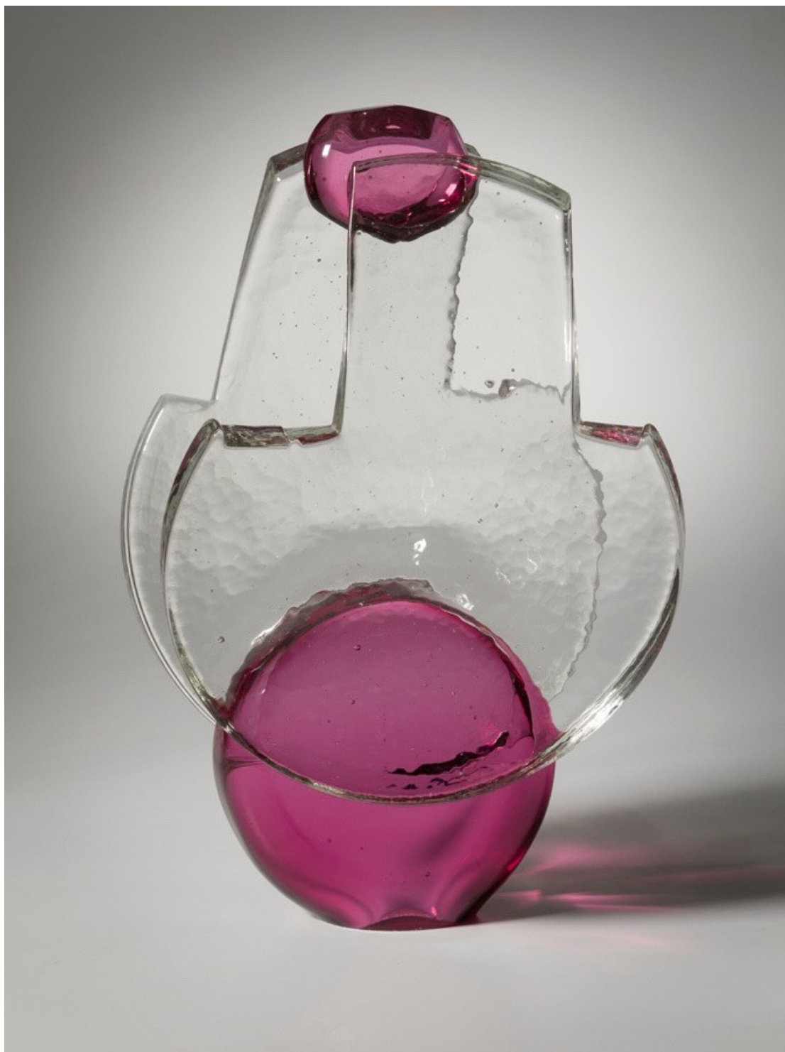
Thoryn Ziemba, Mimic(a) , 2019, blown, cast, cut glass, 20 x 13 x 11 inches