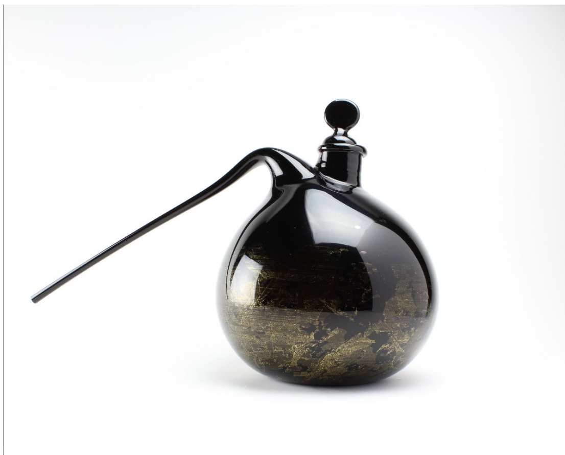
John Shoemaker, Black Retort , 2017, blown glass with 24k gold leaf, 21 x 13 x 10 inches