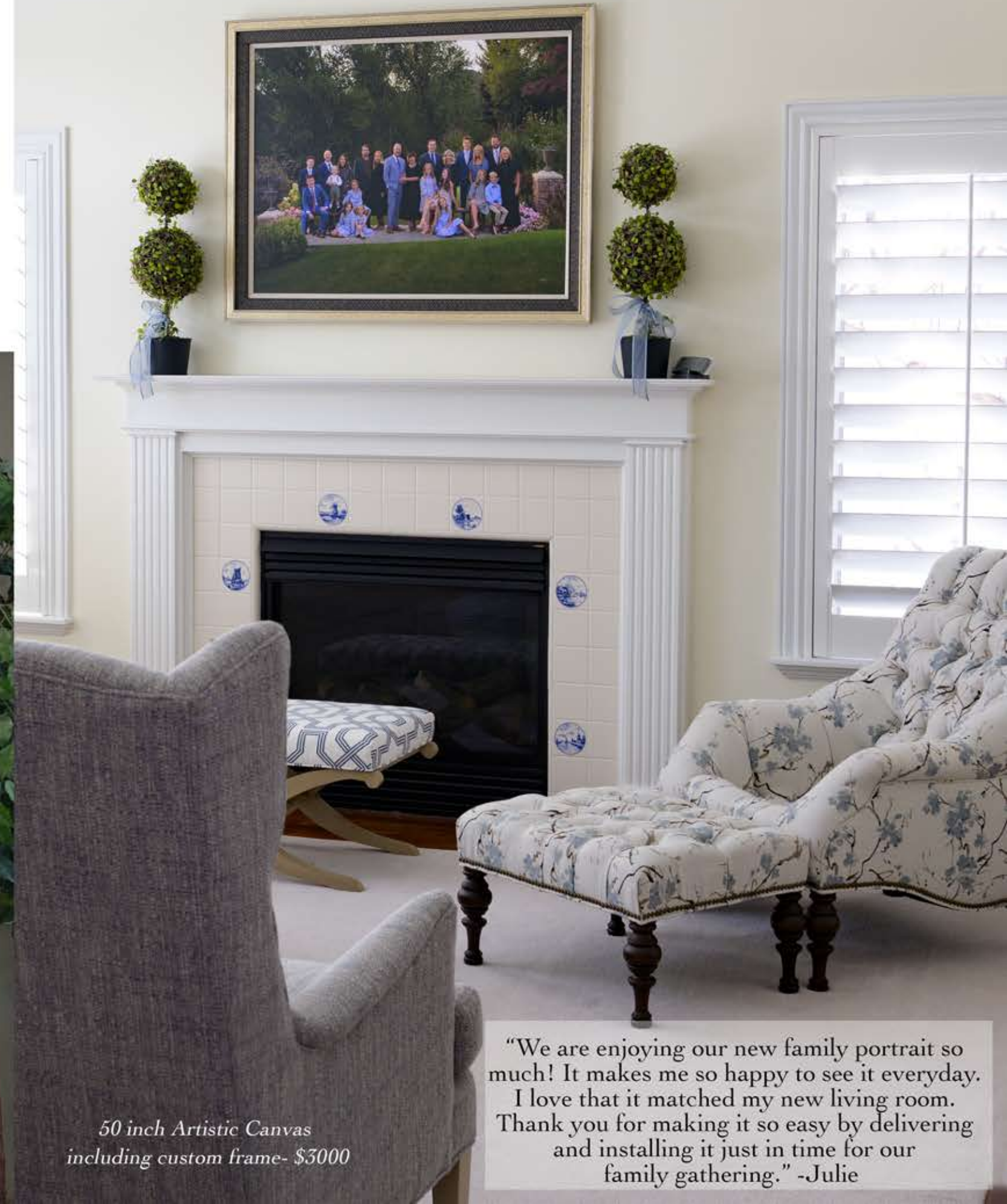
50 inch Artistic Canvas including custom frame- $3000