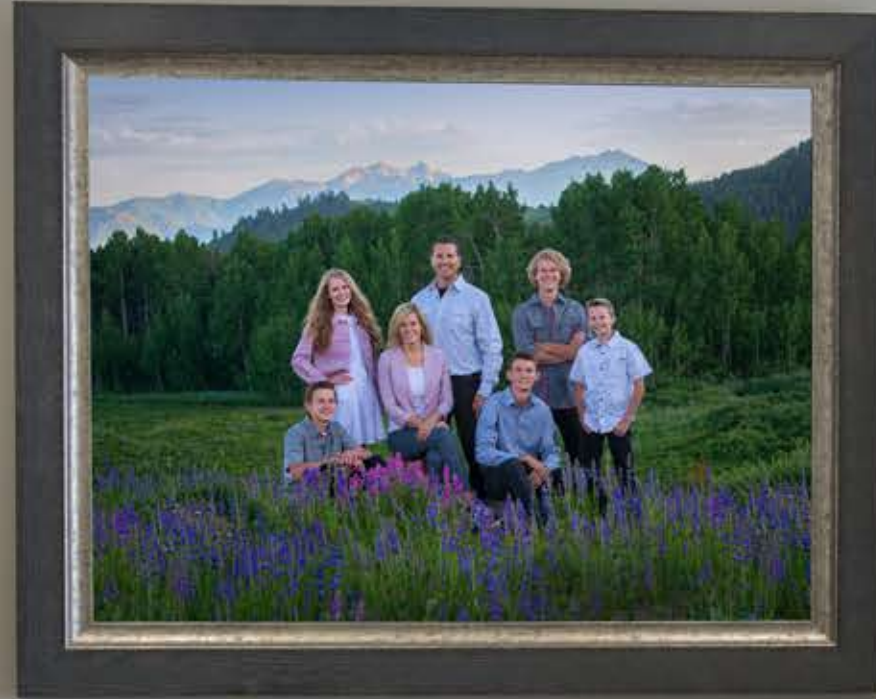
40 inch Artistic Canvas includes custom framing- $ 2200