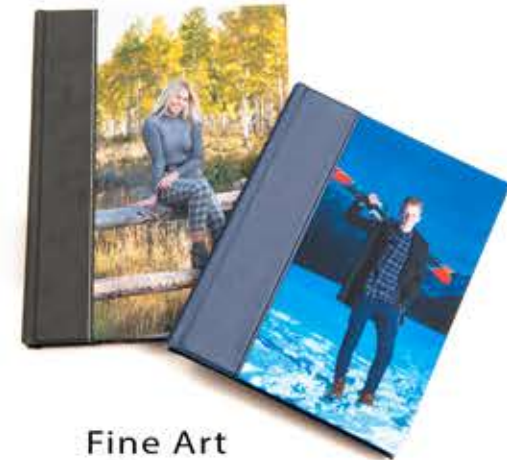
Fine Art Albums

You will love displaying your family portraits in our top of the line albums, books & portfolios. Each product is custom created with fully enhanced, archival printed portraits ready to keep your memories safe for generations to come. All Albums & boxes include matching digital files.