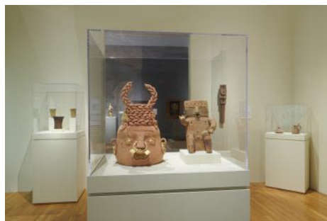
Gallery pairing of a contemporary ceramic work, Pobre Diabla (2022) by artist Joel Gaitan, with a 1000-year-old Seated Male Figure made by the Quimbaya people of Colombia—both with gold nose rings.

Room 100 Gallery , Golden Belt complex, Building 2, room 100, 807 East Main Street, Durham. Ongoing - The gallery is committed to promoting the work of emerging local, regional and national contemporary artists. Exhibitions of varying size and theme will be on view throughout the year with openings coinciding with Third Friday Durham. Hours: Mon.-Sat., 10am-7pm and Sun., noon-6pm. Contact: 919/967-7700 or at (www.goldenbeltarts.com).