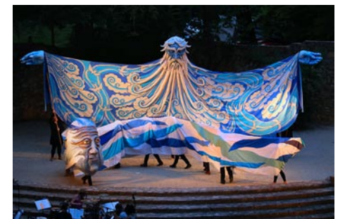
Work from the exhibit, "Of Wings and Feet: The World of PAPERHAND and Jeghetto's Moving Sculptures".

African American artists. Hours: Tue.-Sat., 10am-5pm; Wed., till 7pm & Sun., 2-5pm. Contact: 336/333-6885.